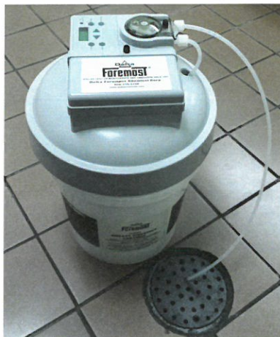
FM 1810-ES GREASE DIGESTING BACTERIA WITH FM 9590 DRAINMASTER PAIL PUMP

CONVENIENT, AUTOMATIC, ECONOMICAL, DISPENSING